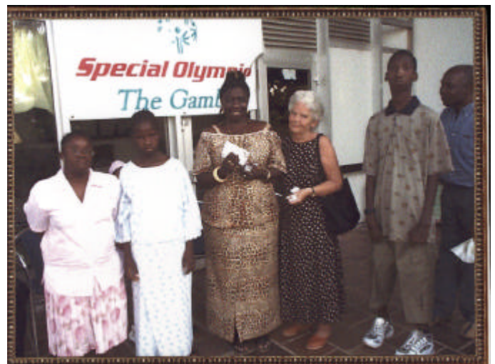
Gambian football photograph in issue 30—July 2003