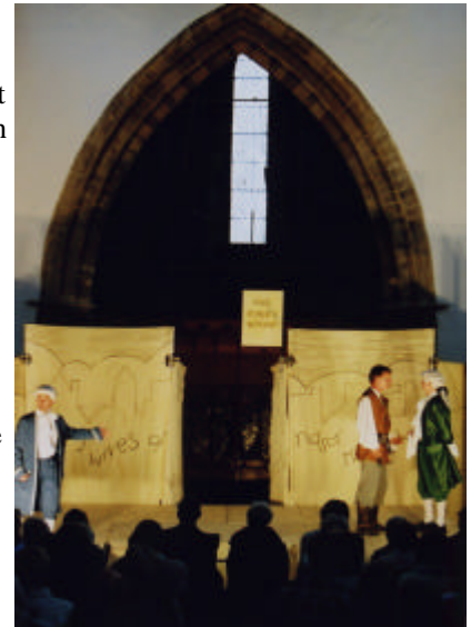
Merry Wives of Windsor 2003

For further details and ticket booking contact Barton Arts on (01652) 637487