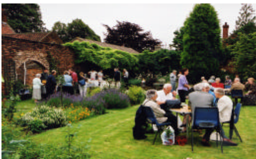
Barton Arts Garden Party 2003

Following from the success of two previous historically themed days over the last three years, Barton Civic Society will recreate the sounds and sites of Medieval Barton this Summer. On Sunday 20th June between 11am and 4pm the area surrounding St. Peter's Church will come alive with street theatre, crafts, demonstrations, stalls and historical characters with plenty to do for all the family. Refreshments will be on sale throughout the day at Tyrwhitt Hall provided by Trinity Methodist Chapel as part of their annual garden party.